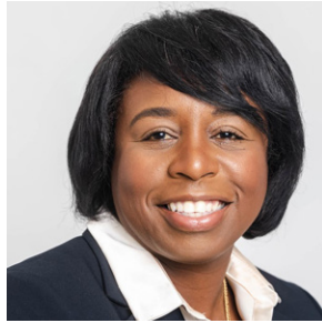
Commissioner Alonzetta Simpkins Gadsden County