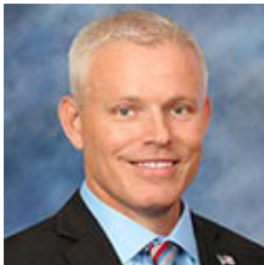
Commissioner Sean Parks Lake County