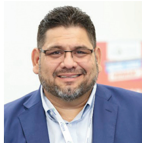
Commissioner Noey Flores