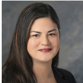
Commissioner Peggy Choudhry