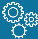
County Operations and Efficiencies