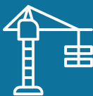
Infrastructure & Environment